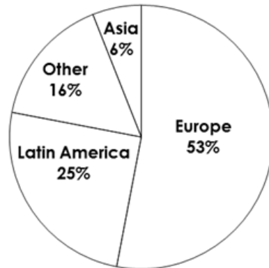
Immigration to the United States, 1971-1980